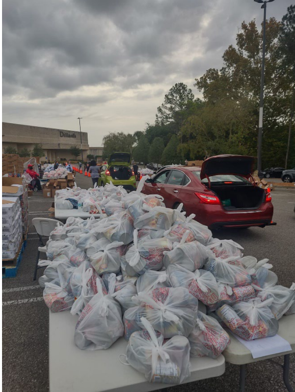
Figure 2 Fall 2021 Strike Out Hunger food donation bags.

Total Impacted Individuals who benefitted from food assistance: