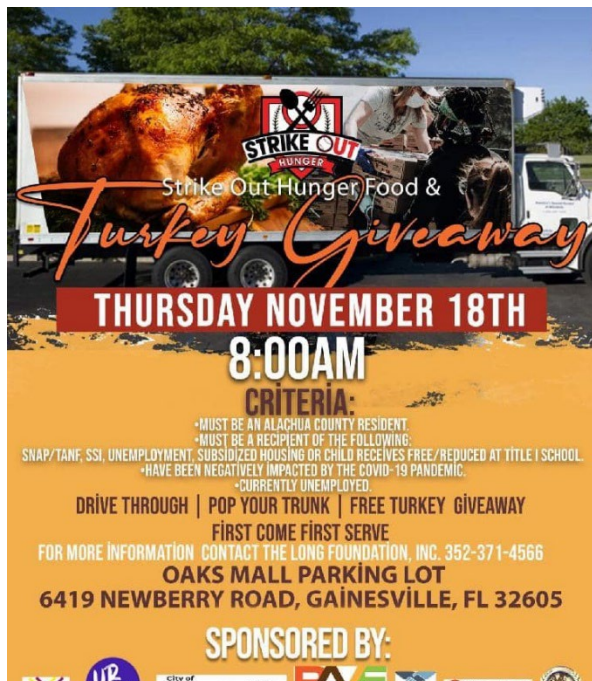
Figure 1 Fall 2021 Strike Out Hunger information and community outreach sheet.

Over four years, approximately $75,000 will be distributed between local food banks, small local farmers, and marginalized and underserved community non-profits in support of emergency food assistance. This program has flexibility in deploying its allocated resources to reach overall programmatic goals. Though not implemented in the first year, approximately $25,000 may be allocated for fresh produce purchased from small local farmers. Another $50,000 will be allocated for food purchasing card distribution.