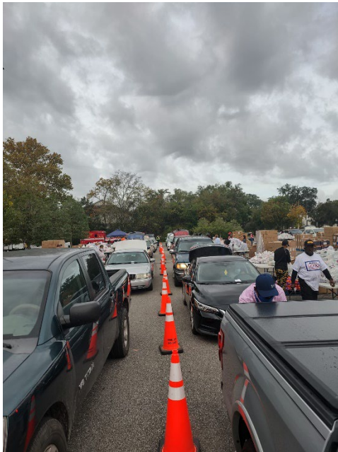
Figure 3 Fall 2022 Strike Out Hunger Food Drive participants being served.