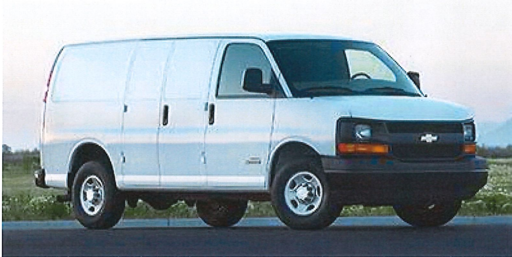
Note: Photo may not represent exact vehicle or selected equipment.

Vehicle: [Fleet] 2020 Chevrolet Express Cargo Van (CG23405) RWD 2500 135" (✔ Complete)