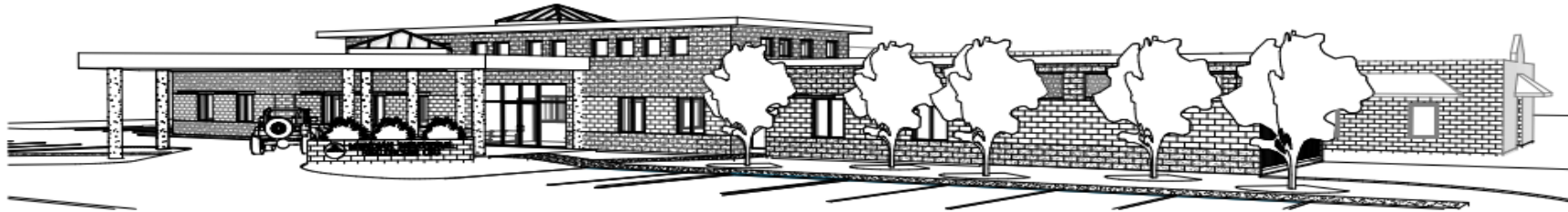
2 PERSPECTIVE - LOOKING NORTHWEST A2 SCALE: