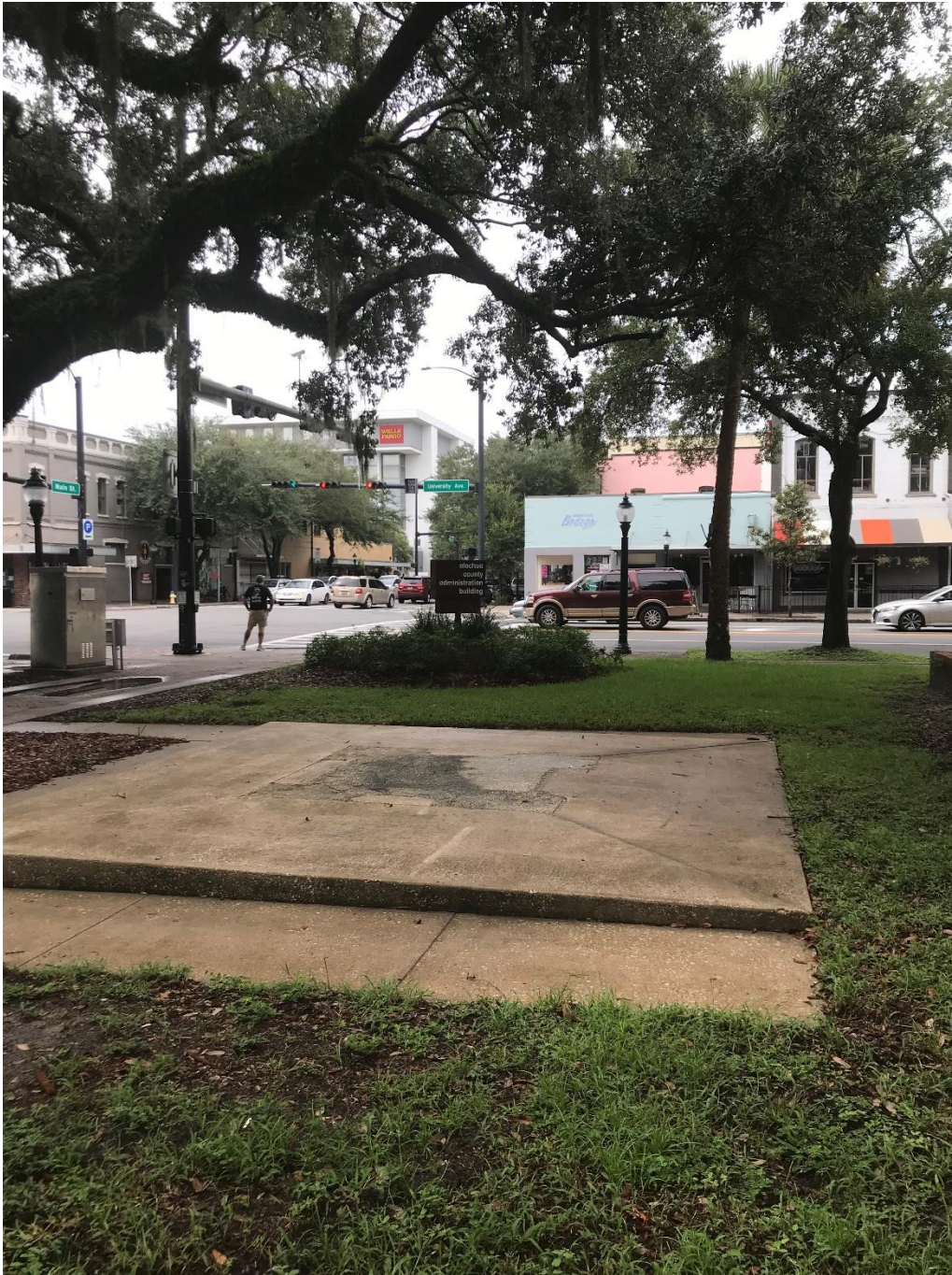
North view of the slab