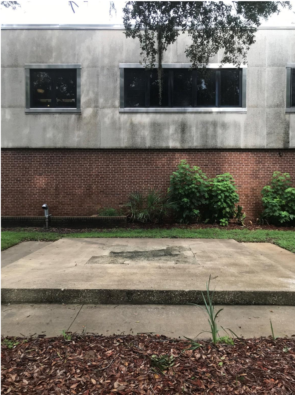
East view of the slab