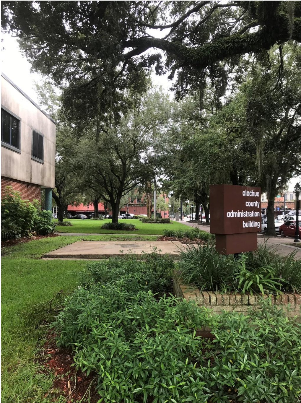
South view of the slab