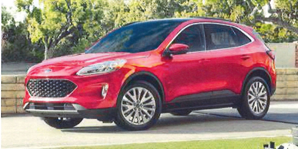
Note:Photo may not represent exact vehicle or selected equipment.

Vehicle: [Fleet] 2020 Ford Escape (U9F) S AWD (✔ Complete)