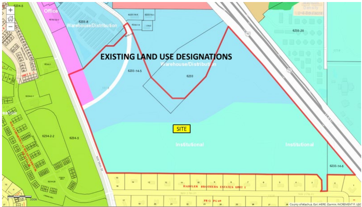
Existing Land Use Designations