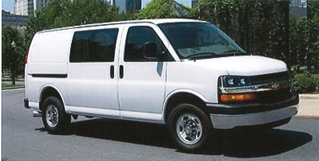
Note:Photo may not represent exact vehicle or selected equipment.

Vehicle: [Fleet] 2020 Chevrolet Express Passenger (CG33706) RWD 3500 155" LS (✔ Complete)