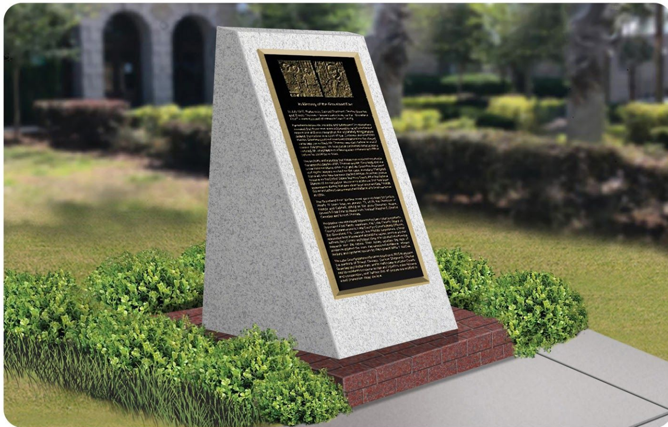
Honed Medium Gray Granite Die - India Red Granite Base