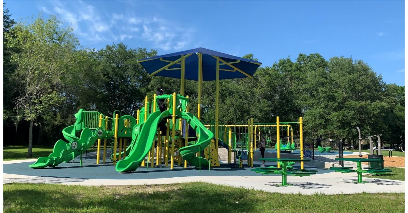
Squirrel Ridge Park