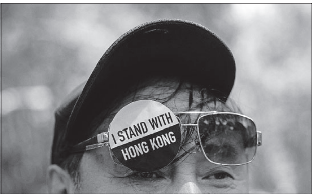
A man with a sticker that reads “I Stand With Hong Kong” on his glasses gathered with others Sunday in Lafayette Square in front of the White House in Washington in solidarity with the “Stand With Hong Kong, Power to the People Rally” in Hong Kong.

Zarif said the tanker’s seizure in July by British Royal Marines “was not based on any law,” while speaking in English to reporters in Helsinki, Finland.