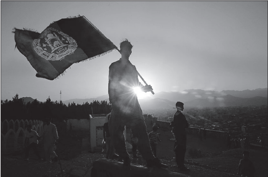
A man waves an Afghan flag during Independence Day celebrations Monday in Kabul, Afghanistan.

He was drained after a day of burying the dead, which included the 8-year-old brother