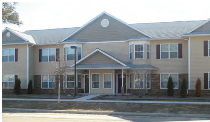
Gateway Village Apartments in Frankfort, Michigan.

In the grand scheme of things, 36 affordable apartments may not sound like a lot, but in a small city like Frankfort located in a rural county facing a lack of workforce housing, the apartments have been a valued addition.