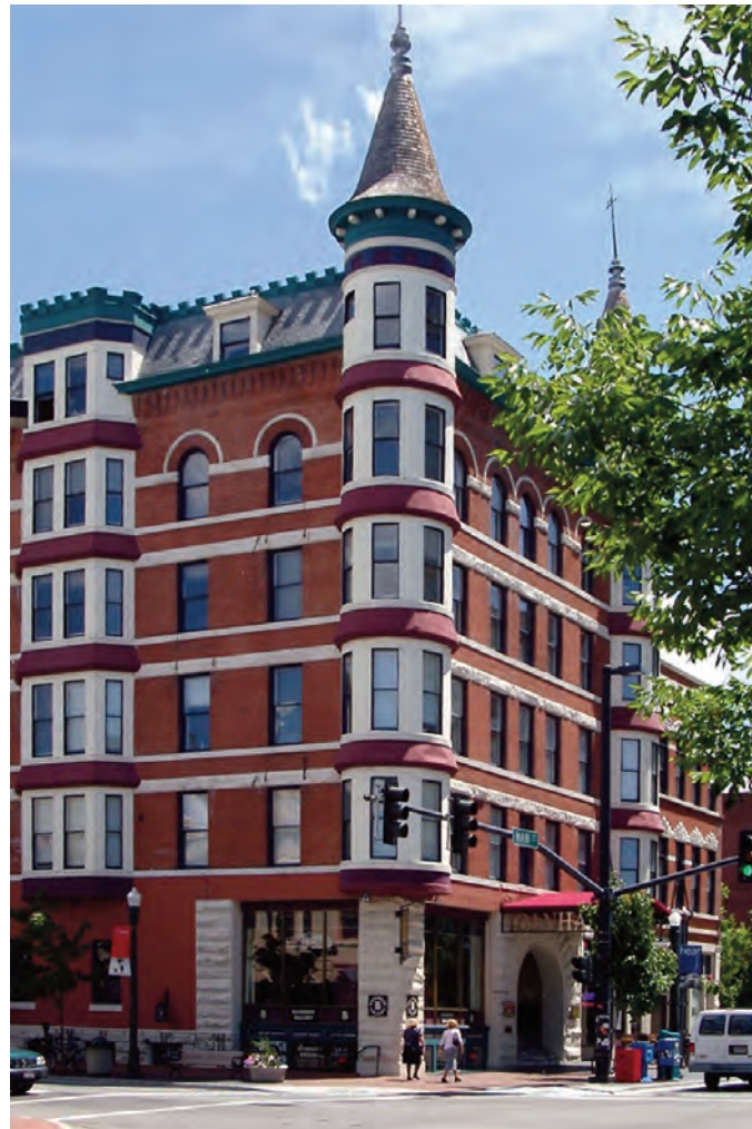
The iconic "Idanha" – first opened as a hotel in 1901 and once the tallest building in Idaho – is one of several downtown Boise buildings that include low or moderate income apartments.

In 2004 CCDC advocated on behalf of a building code amendment that promoted