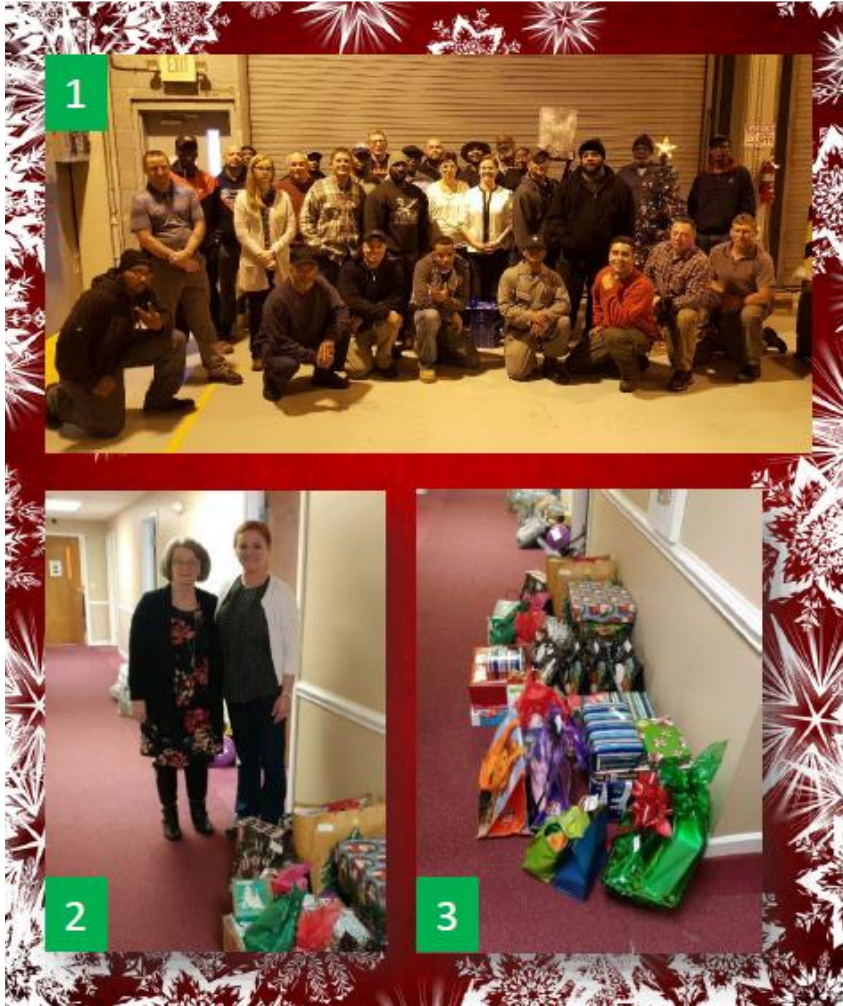
USAR ECS 125 Dec 2018 Community Toy Drive