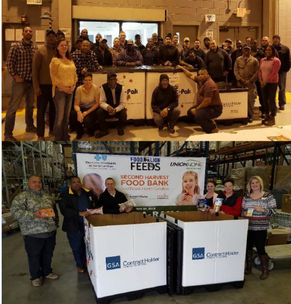
USAR ECS 125 Nov 2018 Community Food Drive