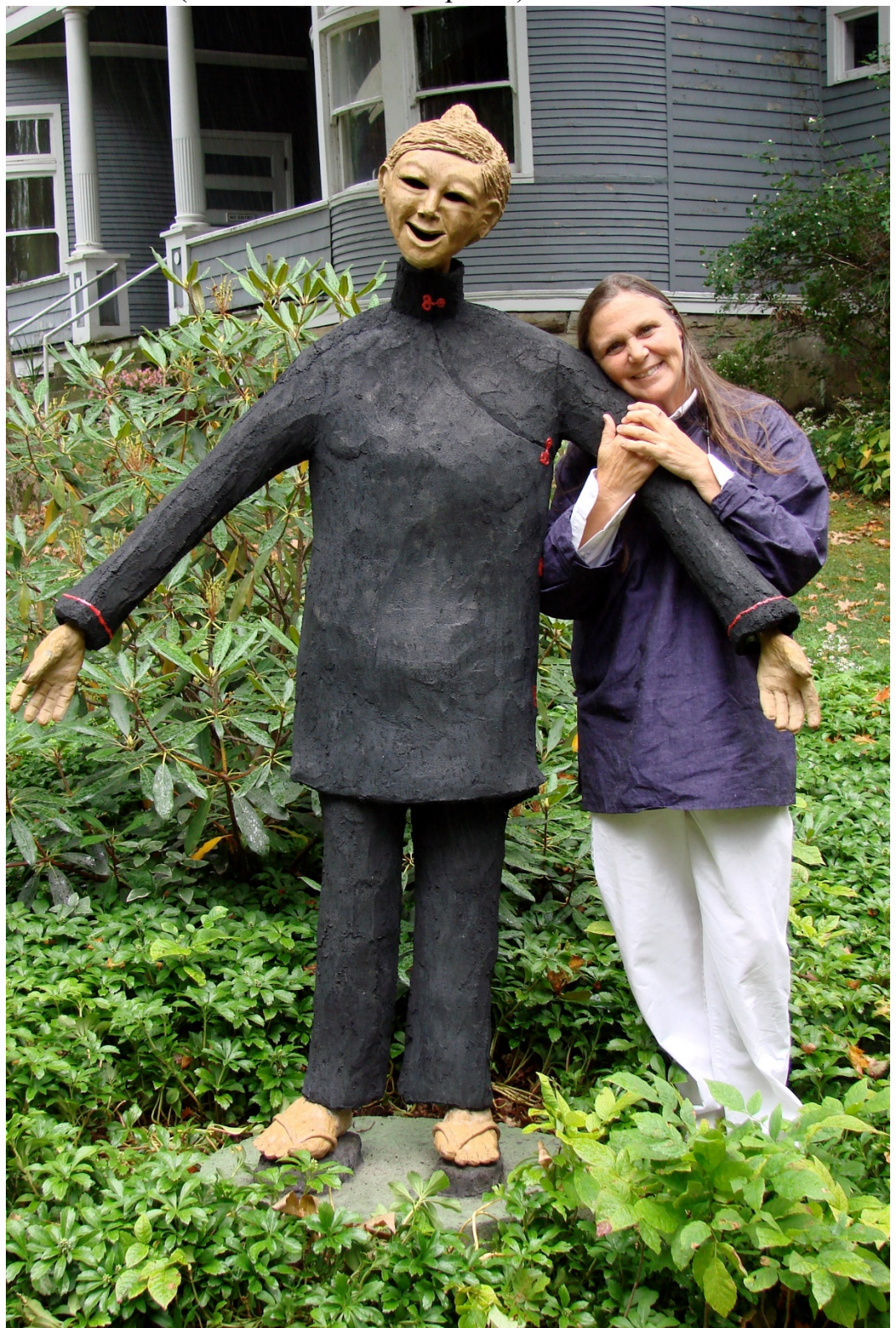
Ba Hoa Binh (esteemed woman of peace)