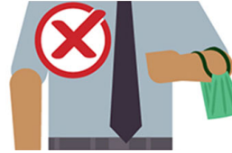
On your arm