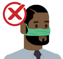
Only on your nose