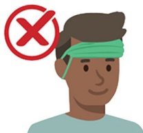
On your forehead