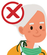
Around your neck