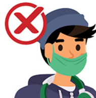
Under your nose