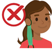
Dangling from one ear