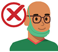
On your chin